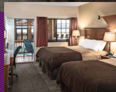
Double Queen Poolside