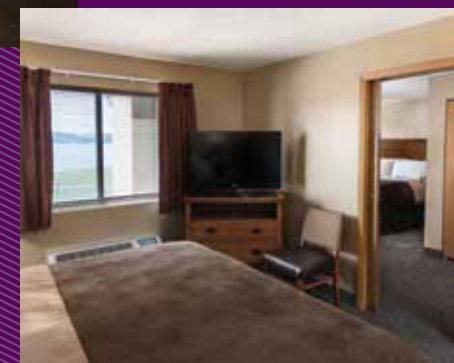
Family Suite Riverside