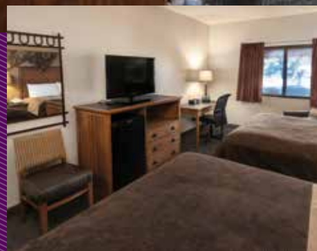
Double Queen Hillside