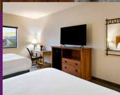
Double Queen Hillside