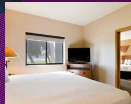
Family Suite Riverside