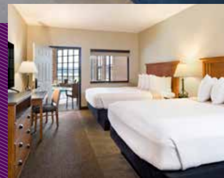
Double Queen Poolside